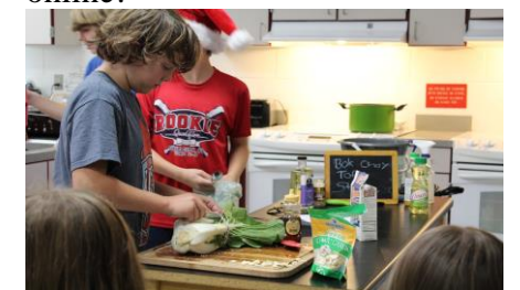
Students prepare Bok Choy Tofu Stir-fry